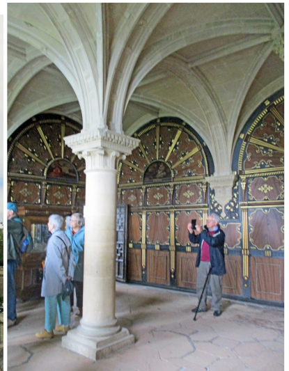
The Small Castle