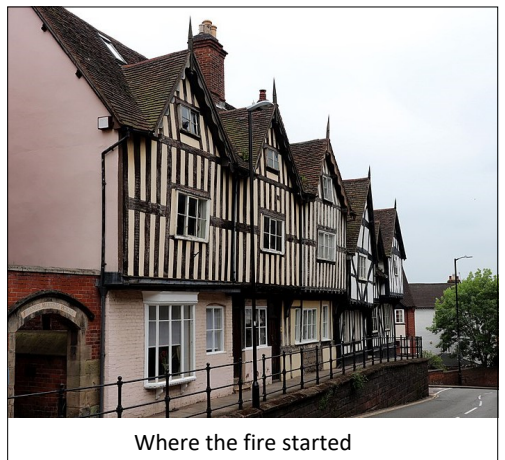
Where the fire started

On Wednesday 5 September 1694, much of the centre of Warwick was devastated by a great fire. In the immediate aftermath the town's leaders gathered to bring relief to the citizens and then, as the urgent crisis passed, they rebuilt Warwick to be one of the most modern and elegant towns in the Midlands. The talk tells the story of the fire and the actions of the town's leaders, and then looks at some of the most impressive post-fire buildings still standing in the town.